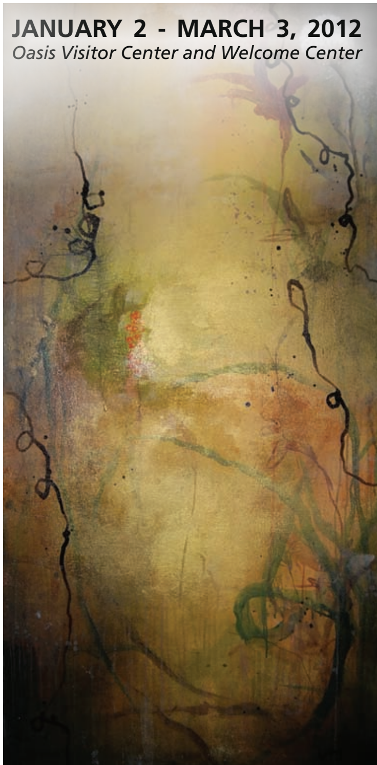
Echoes of a Lifetime by Deedra Ludwig

JANUARY 2 - MARCH 3, 2012 Oasis Visitor Center and Welcome Center